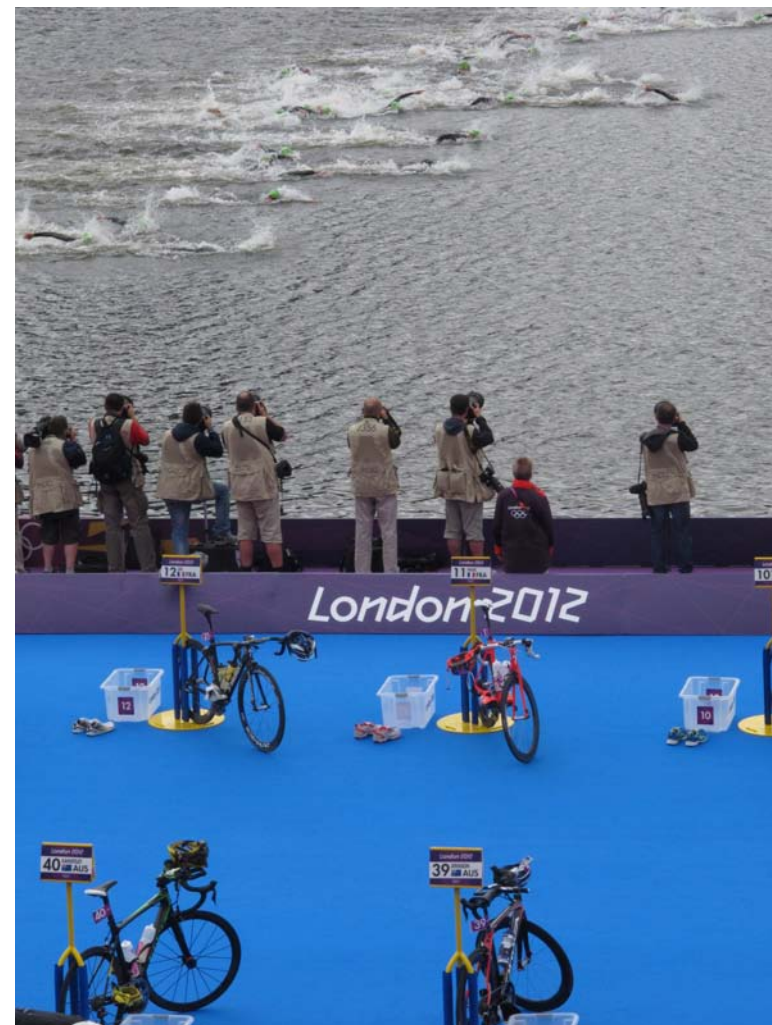
WITH THE TWO BROWLEE BROTHERS WINNING GOLD AND BRONZE IN THE TRIATHLON