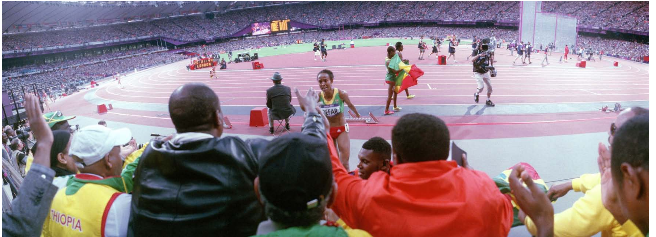
ETHIOPIAN MESERET DEFAR DASHED COMPATRIOT TIRUNESH DIBABA'S DREAMS OF ANOTHER LONG-DISTANCE DOUBLE BY REGAINING HER 5,000 METERS TITLE