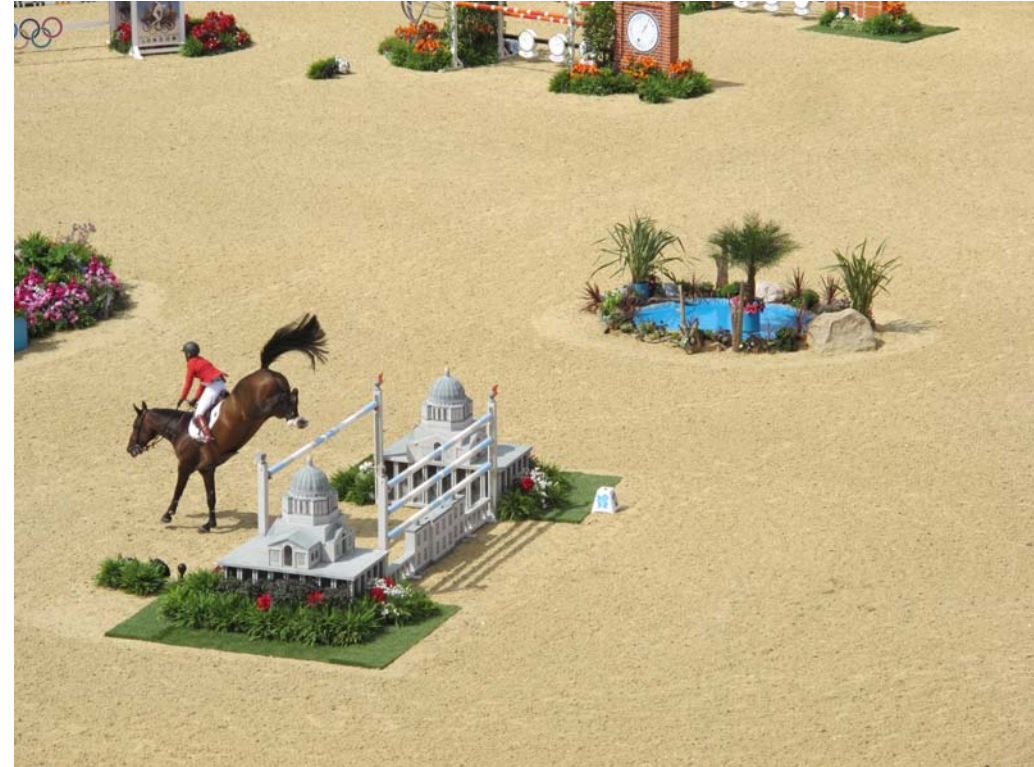
EQUESTRIAN JUMPING IN GREENWICH PARK.