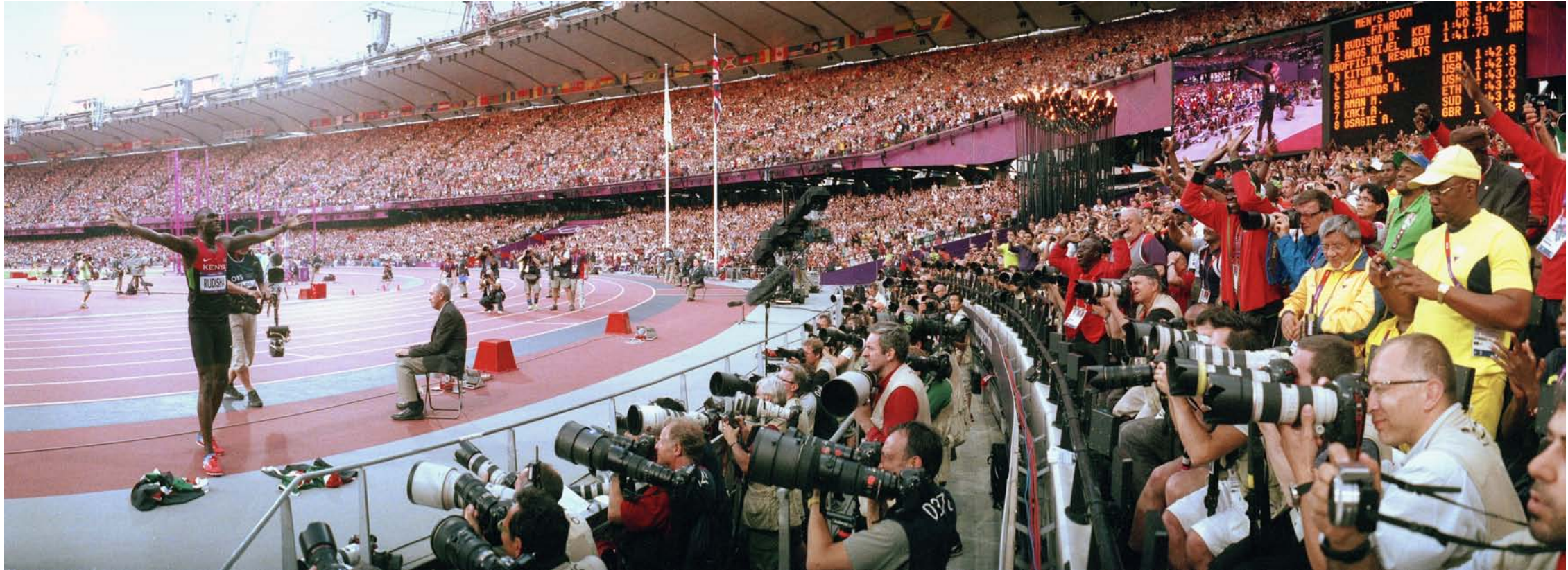
RUDISHA FROM KENYA IN FRONT OF THE PHOTOGRAPHERS AFTER HIS WORLD RECORD ON THE MEN 800 METERS