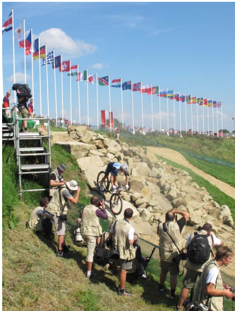
MOUNTAIN BIKE AND BMX