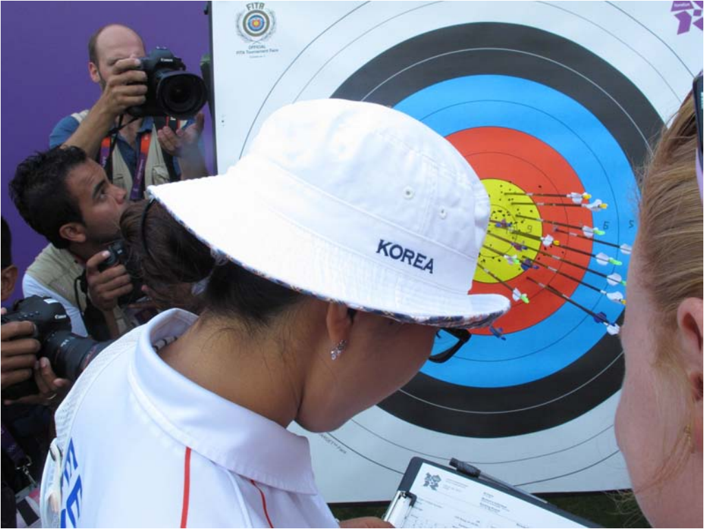
SUNG JIN LEE OF KOREA WON GOLD FOR THE WOMEN'S TEAM ARCHERY MATCH BETWEEN KOREA AND CHINA S AT LORD'S CRICKET GROUND ON JULY 29, 2012 IN LONDON, ENGLAND. HERE IN THE INDIVIDUAL QUALIFICATION SESSION