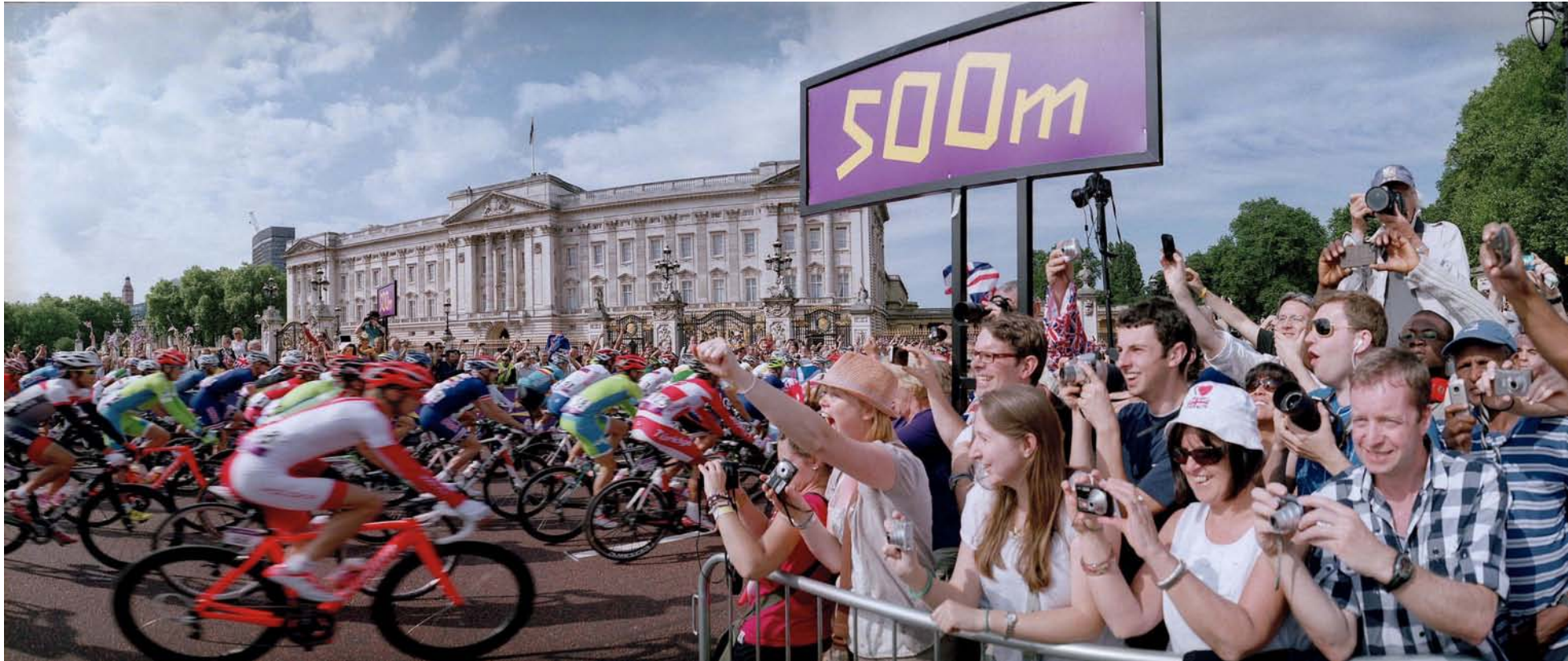
ROAD CYCLING RACE IN FRONT OF WESTMINSTER