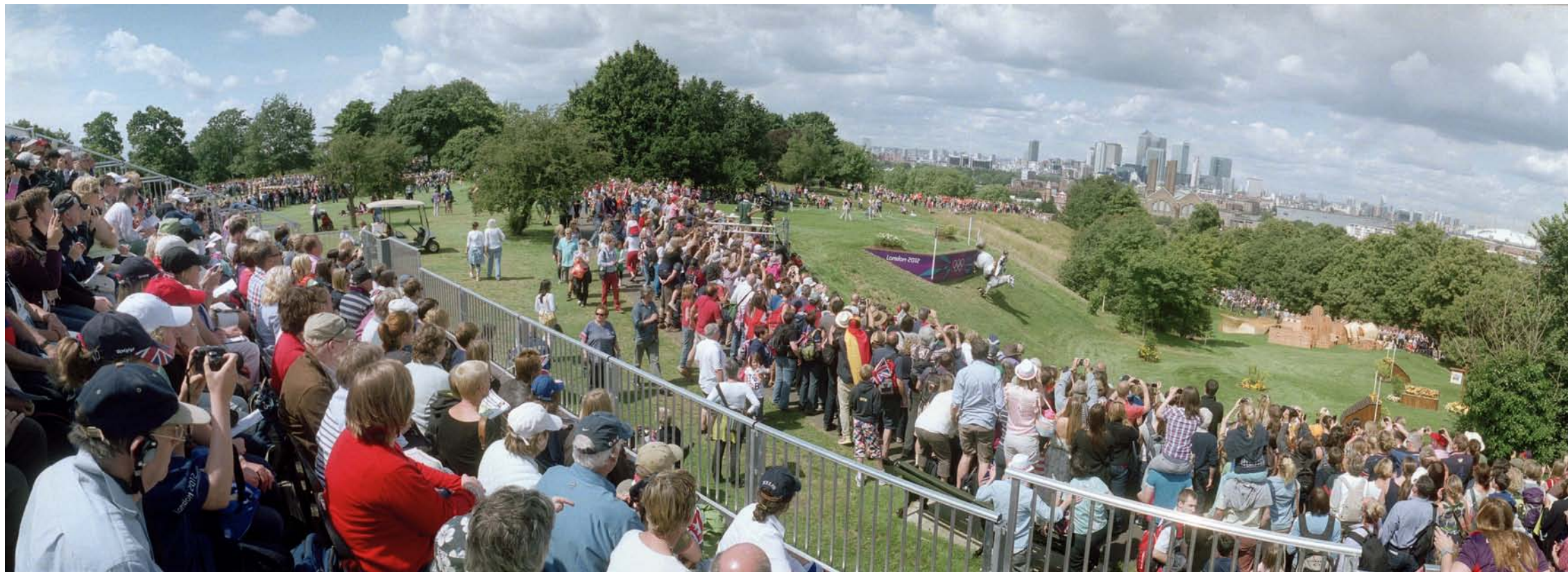
EQUESTRIAN CROSS COUNTRY IN GREENWICH PARK.