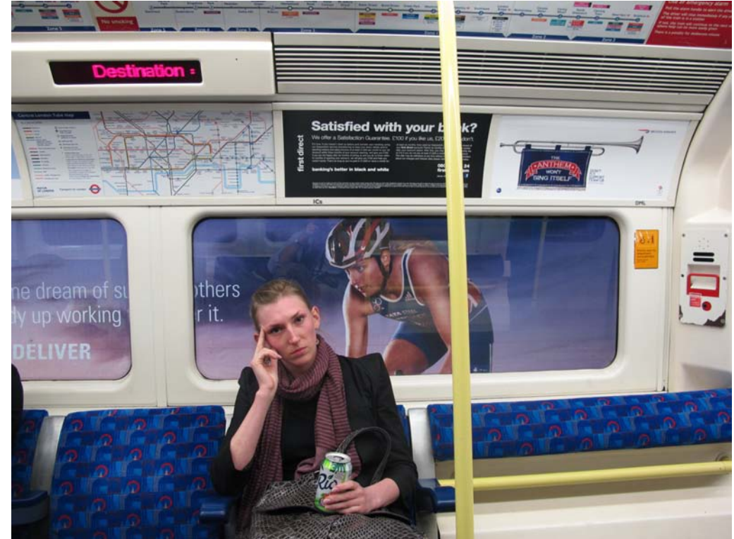
THE GAMES ARE NOW OVER, AS IT READS IN THE LAST IMAGE DESTINATION RIO.