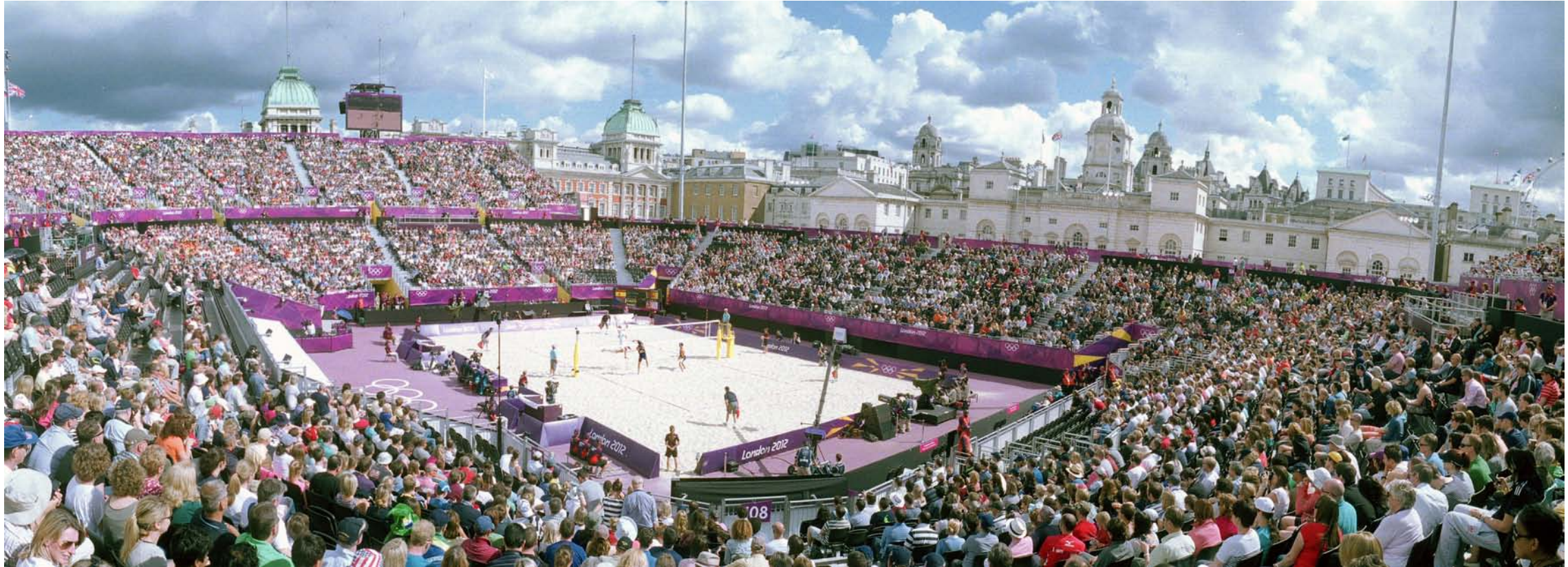
BEACH VOLLEYBALL IN HORSE GUARDS PARADE