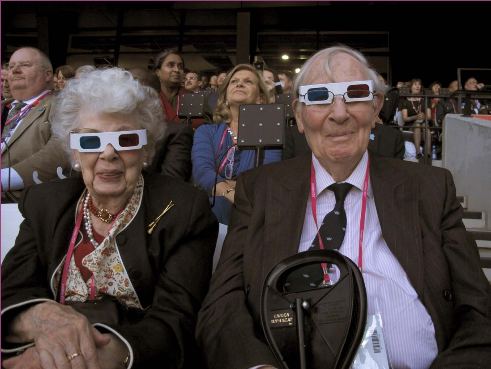
THE GAMES OF LONDON BY PAOLO PELLIZZARI