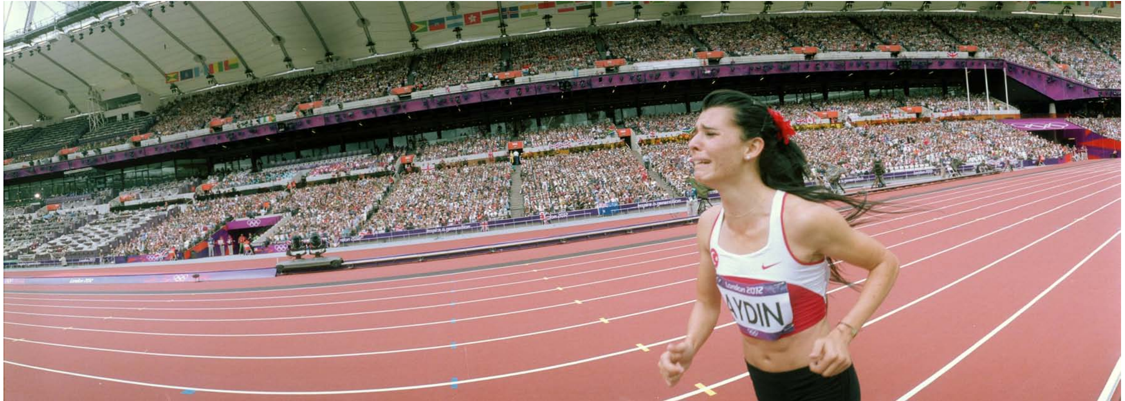
TURKISH ATHLETE MERVE AYDIN FINISHES IN TEARS THE 800 METER DESPITE INJURY.